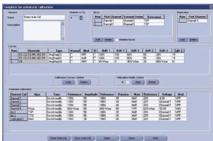
Analysis auto-calibration screen

The Apollo software has also been designed to use a user defined indications table. In this table the user defines the name of the indications, associated three letter code for each indication, which indications may require a secondary review, as well as those indications where only the tube information and three letter codes are required.