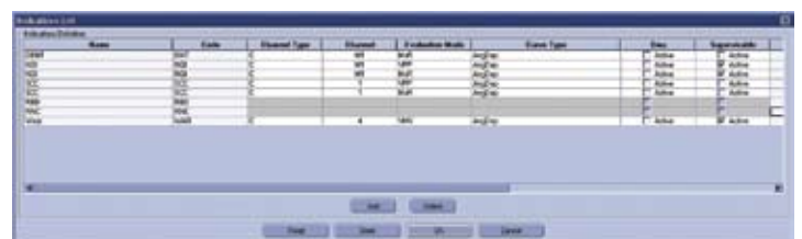
Analyst configured indication codes

The auto calibration feature allows the user to populate and store calibration information for several components and then copy that information to other testers, resulting in reduced errors. The auto calibration is also capable of creating mixes, duplicate channels, calibration curves (if used) and span, rotations and voltage setup for all channels required for the specific exam.